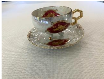
Great Grandma's Tea Cup

Each hostess brings everything to set her table, so no two tables look alike. Each hostess furnishes her own round table cloth, napkins, dishes, including tea cups, silverware, center piece, and tea pot. It is so fun to watch to see how each table takes on a different personality. At my table I used tea cups that belonged to my grandmother, so the cups are around 70 to 80 years old. I could be wrong and they could be closer to 100 years old. She's not around any longer for me to ask.