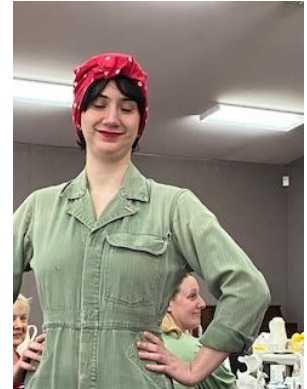
1940's Rosie the Riveter