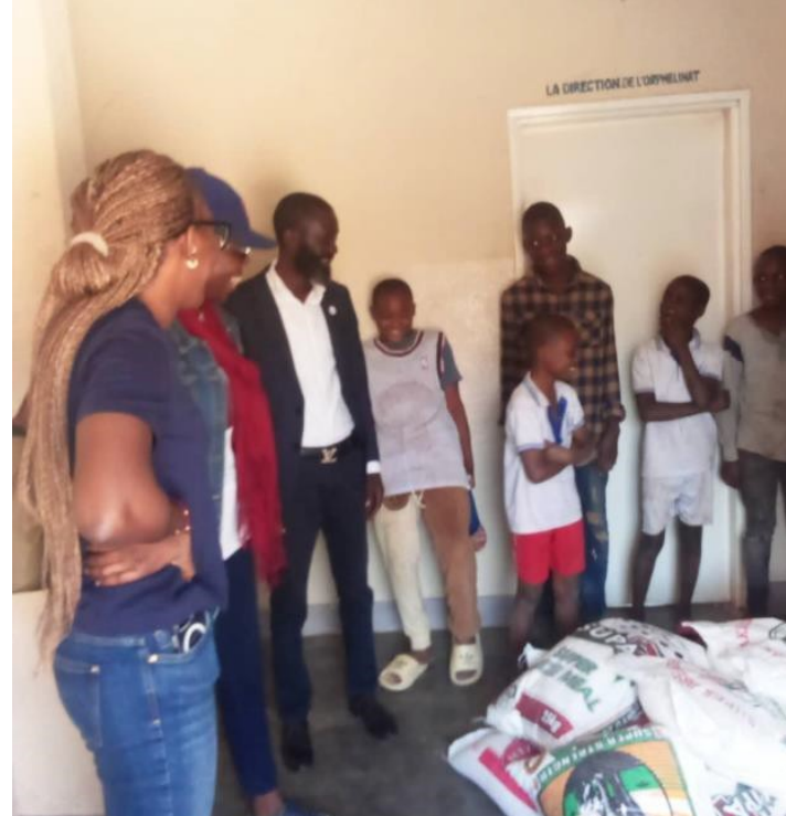
We received some visitors and donations from Mwant Yav family.